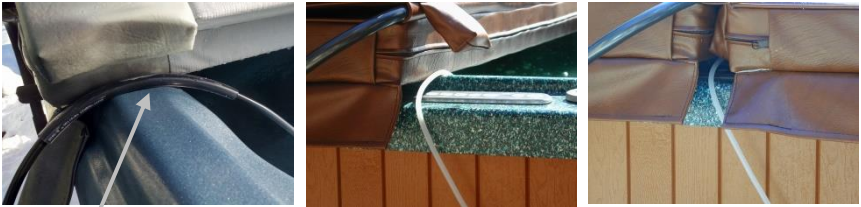
Clear Protector Tube